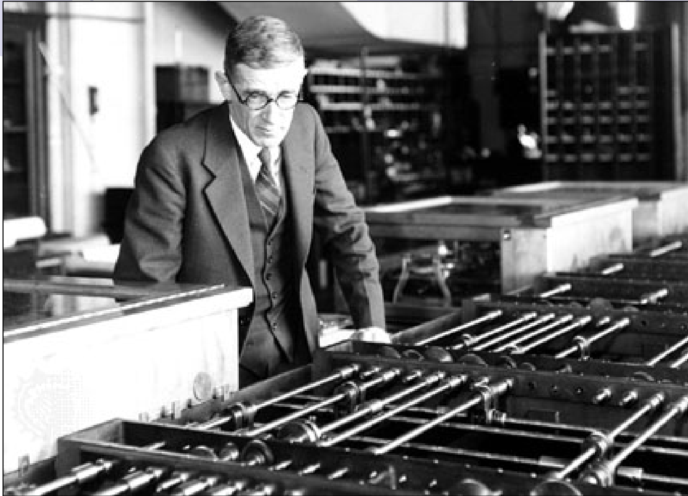
Vannevar Bush with his Differential Analyzer (1935)